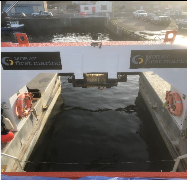
Deck Open - 6m x 3.5m Moon Pool

2 Hydraulic capstans; 4-point anchoring; dive ladder; 4m tender with 25hp outboard